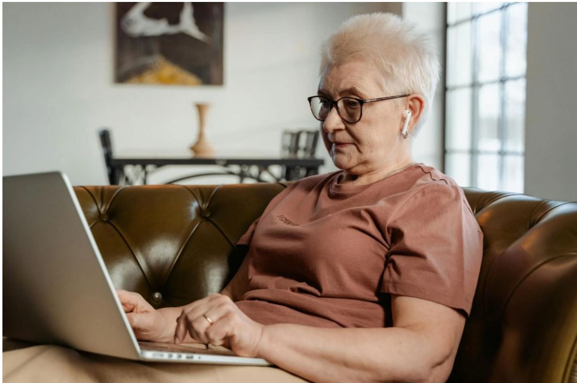
Smart Home Innovations Enhancing Independent Living for the Elderly

© 2024 HONOR Device Co., Ltd. All rights reserved. HONOR, HONOR logo, HONOR Magic7 Lite, Super Resistance, Drop-Resistance, Water-Resistance, Heat-Resistance, MATRIX 108MP SENSOR, MagicOS, and the HONOR logo are trademarks of HONOR Device Co., Ltd. in China and other countries. All other trademarks are the property of their respective owners. The actual appearance of the product may vary from the image shown. The image is for reference only. The actual appearance of the product may vary from the image shown. The image is for reference only.