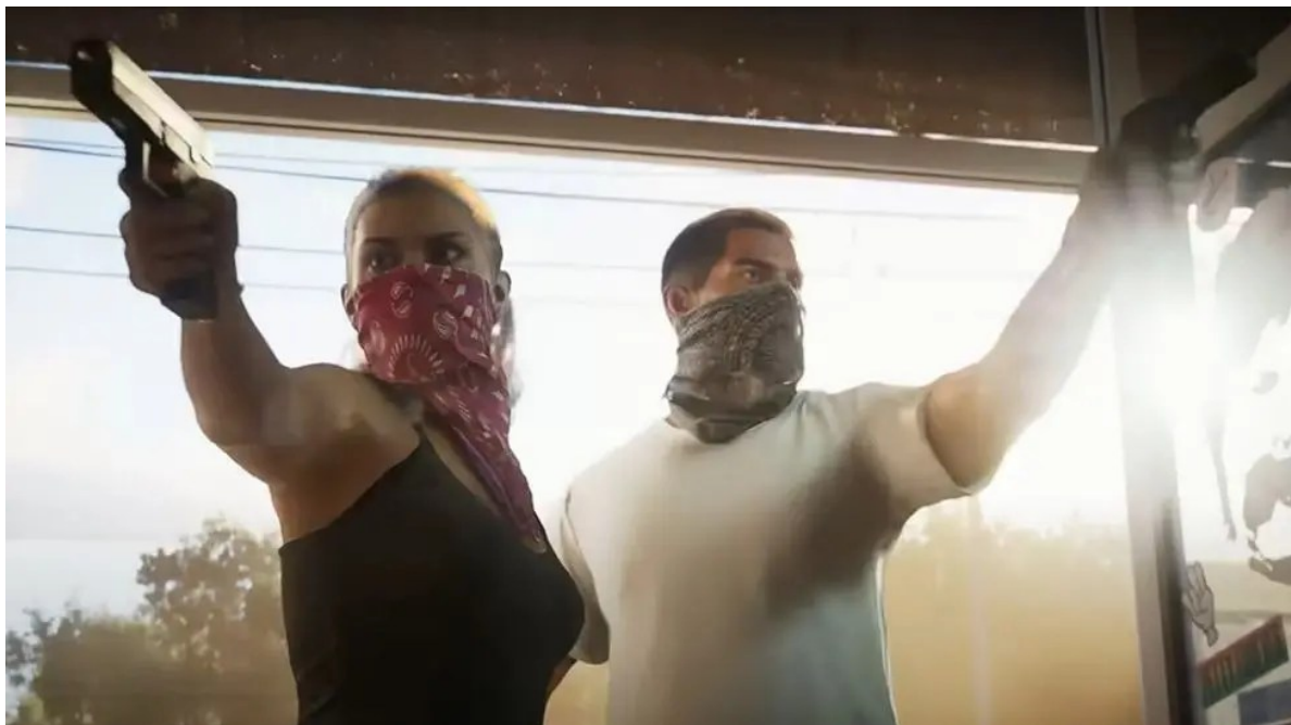
UK urges YouTube and TikTok to promote educational content, scientists build VR goggles for mice