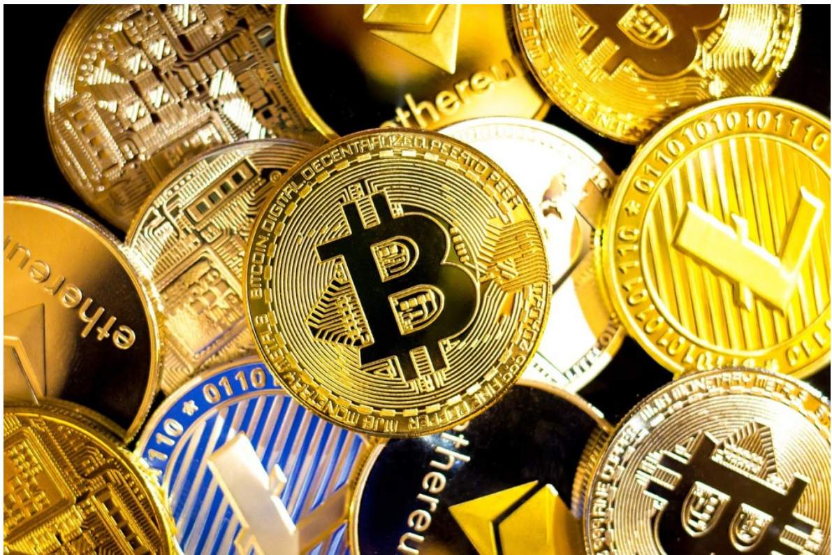
Seven Features That Every Crypto Wallet Must Have

The Future of Email Marketing: Trends to Watch in 2025 and Beyond